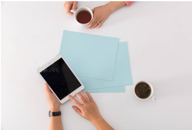
https://images.unsplash.com/photo-1554415707-c1d26270e0d0?ixlib=rl-1&ixid=eyJhcHBGWOJFvMDI9&auto=format&fit=crop&w=500&h=600 (viewed 12-11-20)