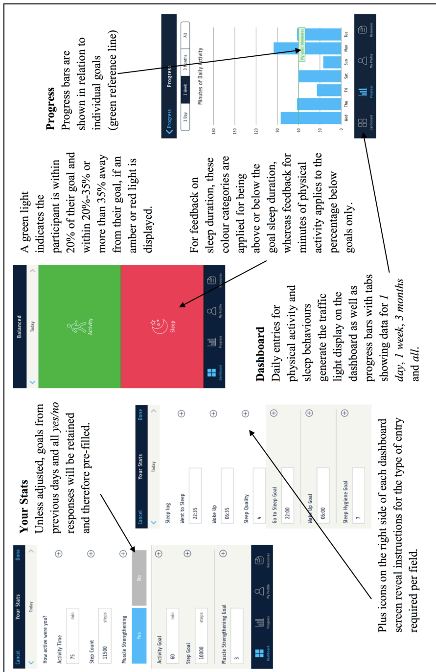
Figure 3 Screenshots of app screens for self-monitoring and feedback relative to goals.